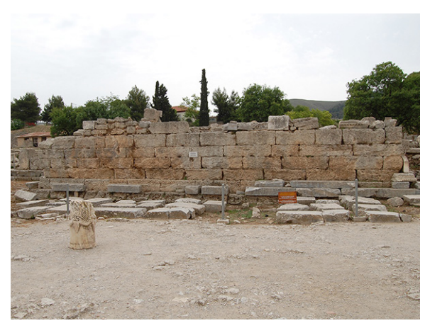
The Bema Judgment Seat