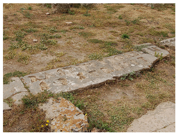
The Erastus Inscription