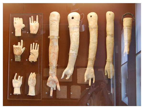
Ex Votos from Sanctuary of Asklepios