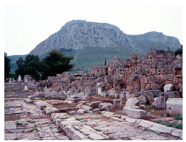
City Streets and Acrocorinth