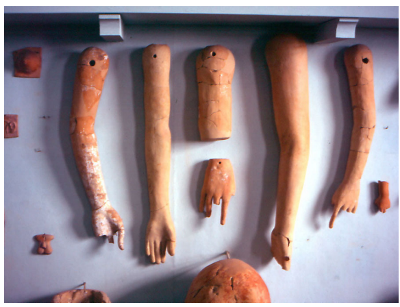
Ex Votos from Sanctuary of Asklepios