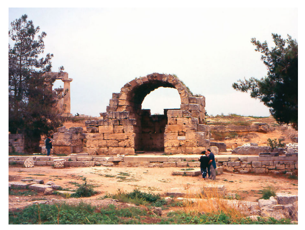
Sacred Fountain in Agora