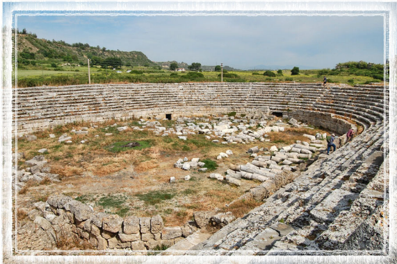
Stadium at Perga