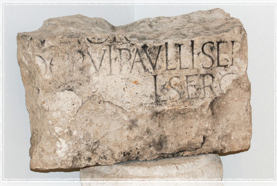
Sergius Paulus Inscription