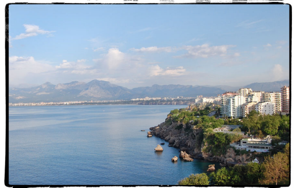
Taurus Mountains viewed from Antalya