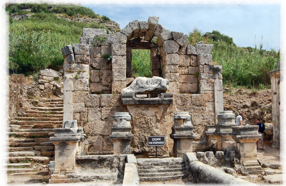
Monumental Fountain at Perga