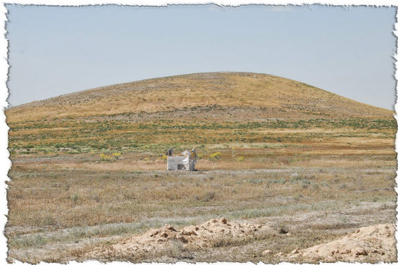
Ruins of Derbe