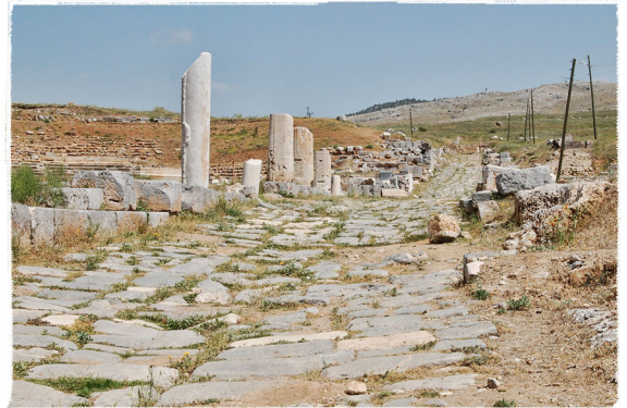
Ancient Streets in Antioch of Pisidia