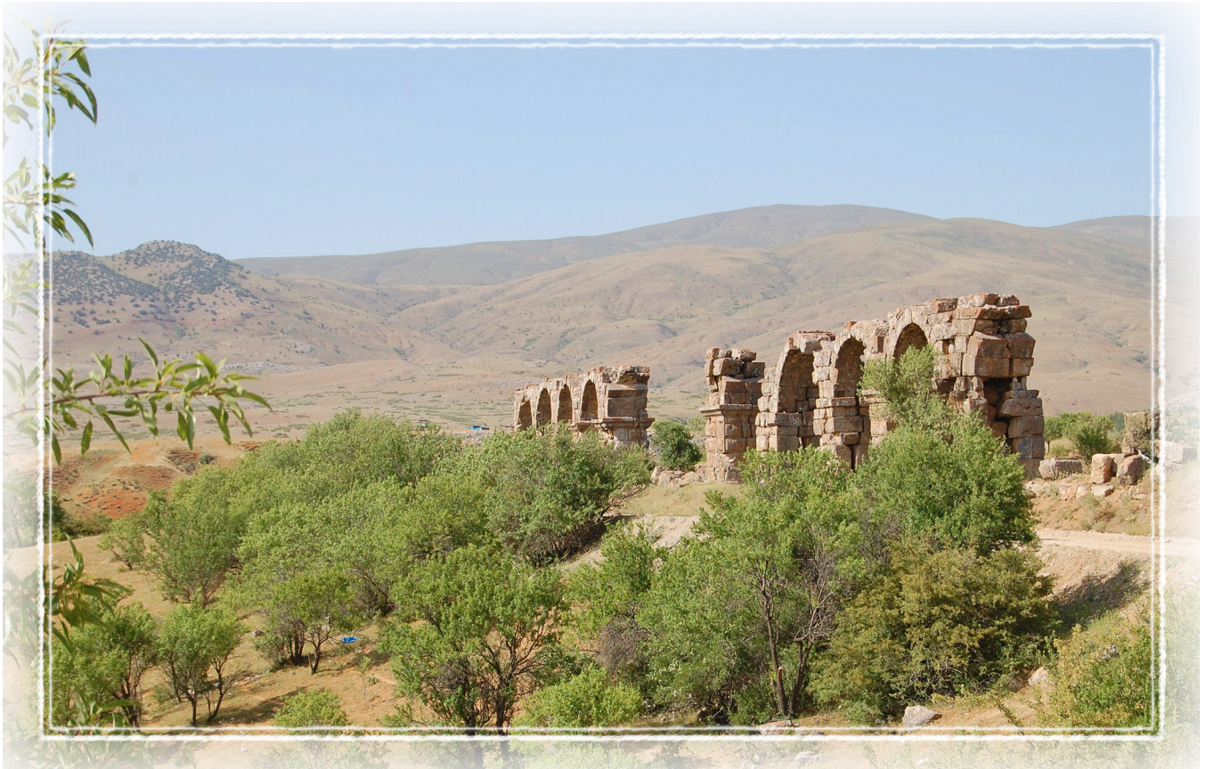
Roman Aqueduct at Antioch in Pisidia

“But when the one who set me apart from birth and called me by his grace was pleased to reveal his Son in me so that I could preach him among the Gentiles, I did not go to ask advice from any human being, nor did I go up to Jerusalem to see those who were apostles before me, but right away I departed to Arabia, and then returned to Damascus.” (Galatians 1:15–17 NET)