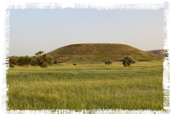
Ruins of Lystra