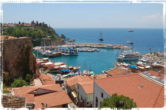
Harbor at Antalya