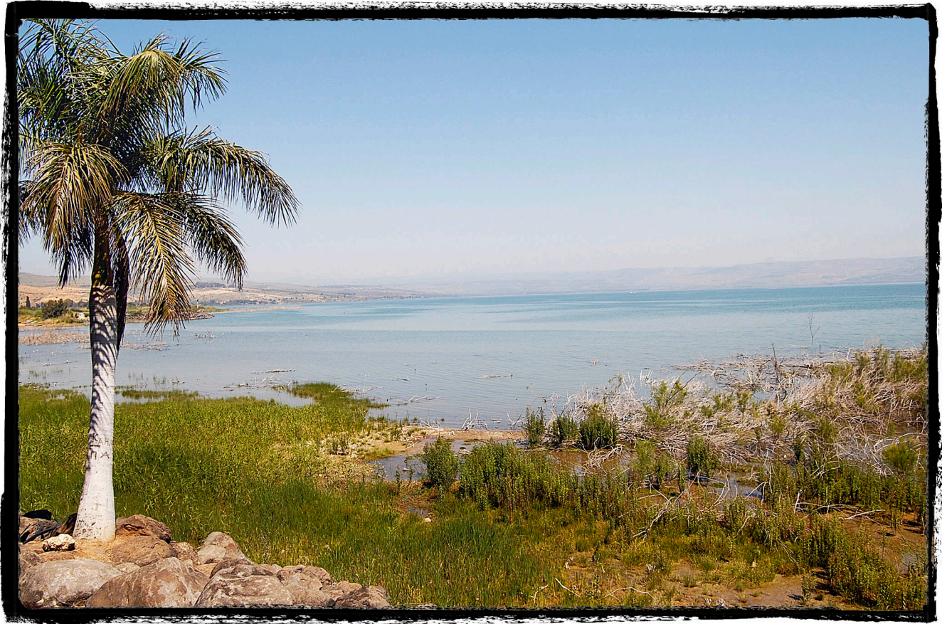
The North Shore of the Sea of Galilee

“Inasmuch as many have taken in hand to set in order a narrative of those things which have been fulfilled among us, just as those who from the beginning were eyewitnesses and ministers of the word delivered them to us, it seemed good to me also, having had perfect understanding of all things from the very first, to write to you an orderly account, most excellent Theophilus, that you may know the certainty of those things in which you were instructed.” (Luke 1:1-4)