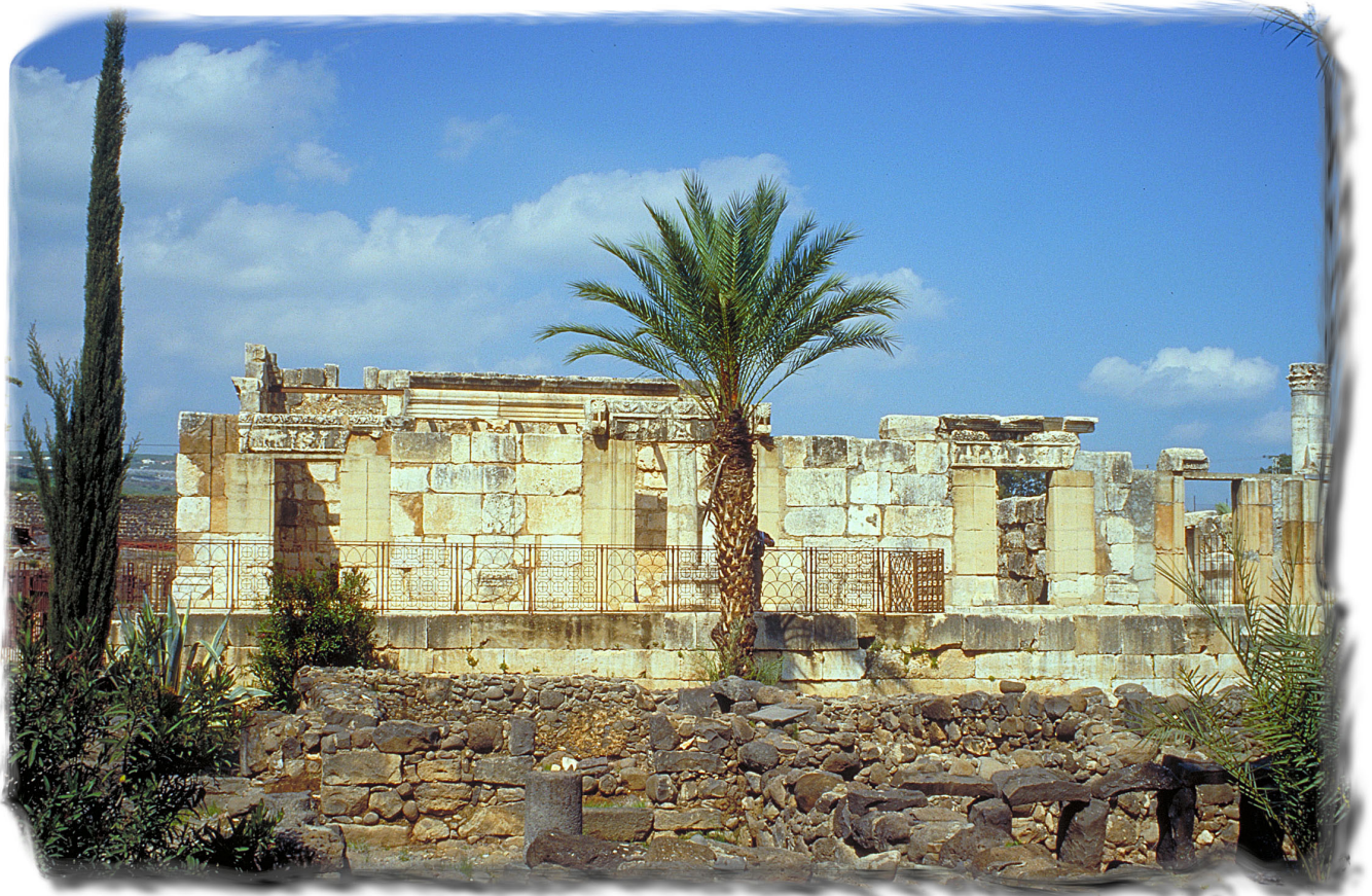
The Synagogue at Capernaum

“This brings you great joy, although you may have to suffer for a short time in various trials. Such trials show the proven character of your faith, which is much more valuable than gold—gold that is tested by fire, even though it is passing away—and will bring praise and glory and honor when Jesus Christ is revealed. You have not seen him, but you love him.” (1 Peter 1:6–8)