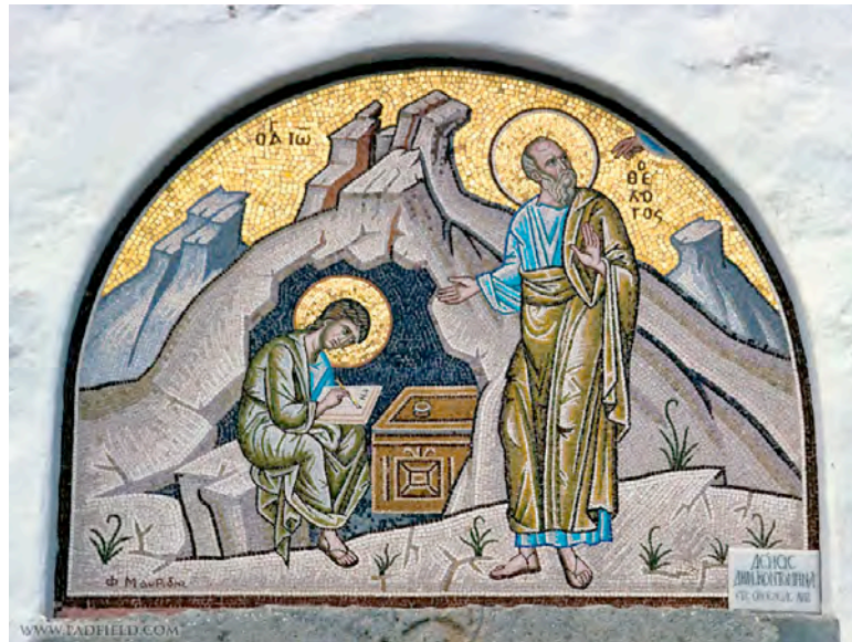
Mosaic above the entrance to the Grotto of the Apocalypse Isle of Patmos