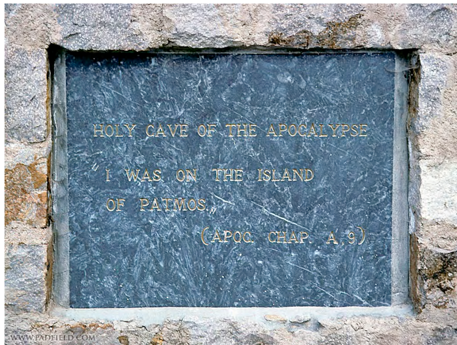
Sign at the Cave of the Apocalypse Isle of Patmos

The book of Revelation is the only book in the New Testament that begins by specifically stating its source, “The Revelation of Jesus Christ, which God gave to Him...and signified it by His angel to His servant John” (Rev. 1:1). The book ends with confirmations of authenticity by God, Christ and John. “And the Lord God of the holy prophets sent His angel to show His servants the things which must shortly take place” (Rev. 22:6); “I, Jesus, have sent My angel to testify to you these things in the churches. I am the Root and the Offspring of David, the Bright and Morning Star” (Rev. 22:16); “Now I, John, saw and heard these things” (Rev. 22:8). Thus the book of Revelation has been given to His servants from God the Father through His Son, Jesus, and revealed to John for our encouragement and edification. “Blessed is he who keeps the words of the prophecy of this book” (Rev. 22:7).