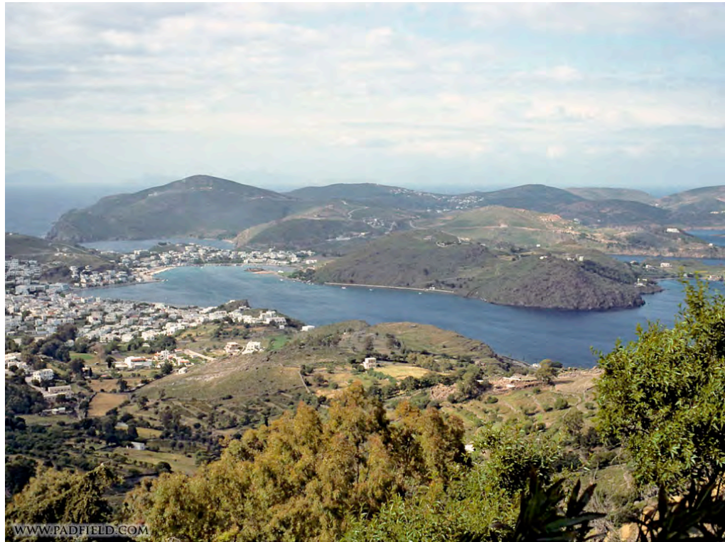
Town of Skala, Isle of Patmos