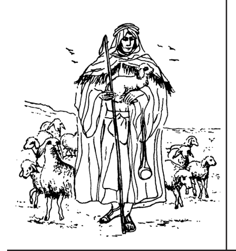
Workbook on First and Second Timothy