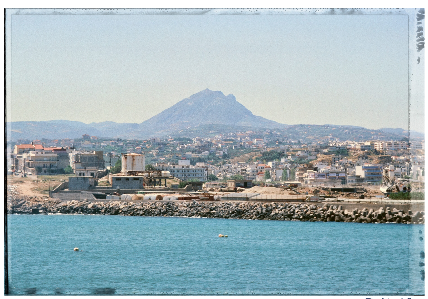
The Isle of Crete

"For this reason I left you in Crete, that you should set in order the things that are lacking, and appoint elders in every city as I commanded you" (Titus 1:5)