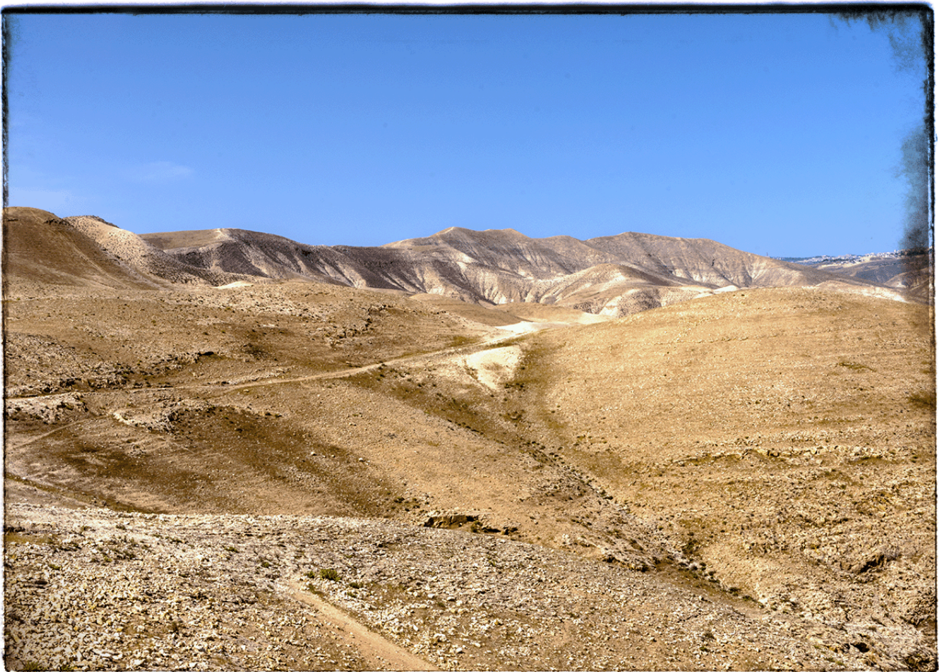
The Wilderness of Judea

“Therefore all the elders of Israel came to the king at Hebron, and King David made a covenant with them at Hebron before the Lord. And they anointed David king over Israel. David was thirty years old when he began to reign, and he reigned forty years.” (2 Samuel 5:3–4)