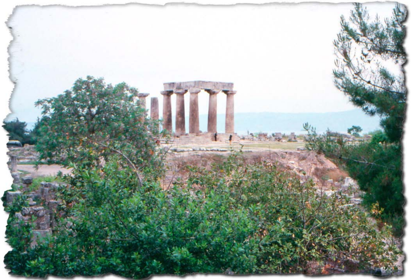
The Temple of Apollo at Corinth

“To the church of God which is at Corinth, to those who are sanctified in Christ Jesus, called to be saints, with all who in every place call on the name of Jesus Christ our Lord, both theirs and ours: grace to you and peace from God our Father and the Lord Jesus Christ” (1 Corinthians 1:2-3)