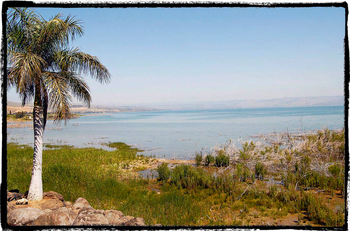
The North Shore of the Sea of Galilee

"Inasmuch as many have taken in hand to set in order a narrative of those things which have been fulfilled among us, just as those who from the beginning were eyewitnesses and ministers of the word delivered them to us, it seemed good to me also, having had perfect understanding of all things from the very first, to write to you an orderly account, most excellent Theophilus, that you may know the certainty of those things in which you were instructed." (Luke 1:1-4)