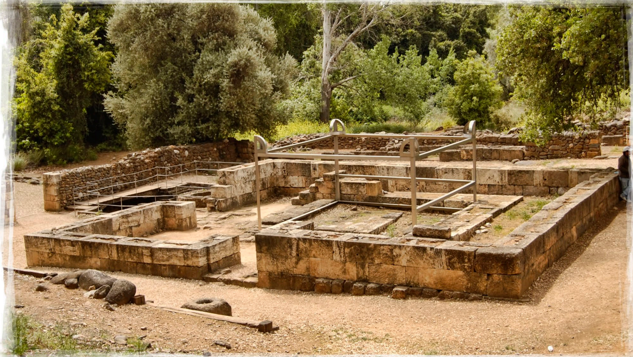
Location of the pagan altar at Dan

“So David rested with his fathers, and was buried in the City of David. The period that David reigned over Israel was forty years; seven years he reigned in Hebron, and in Jerusalem he reigned thirty-three years. Then Solomon sat on the throne of his father David; and his kingdom was firmly established.” (1 Kings 2:10–12)