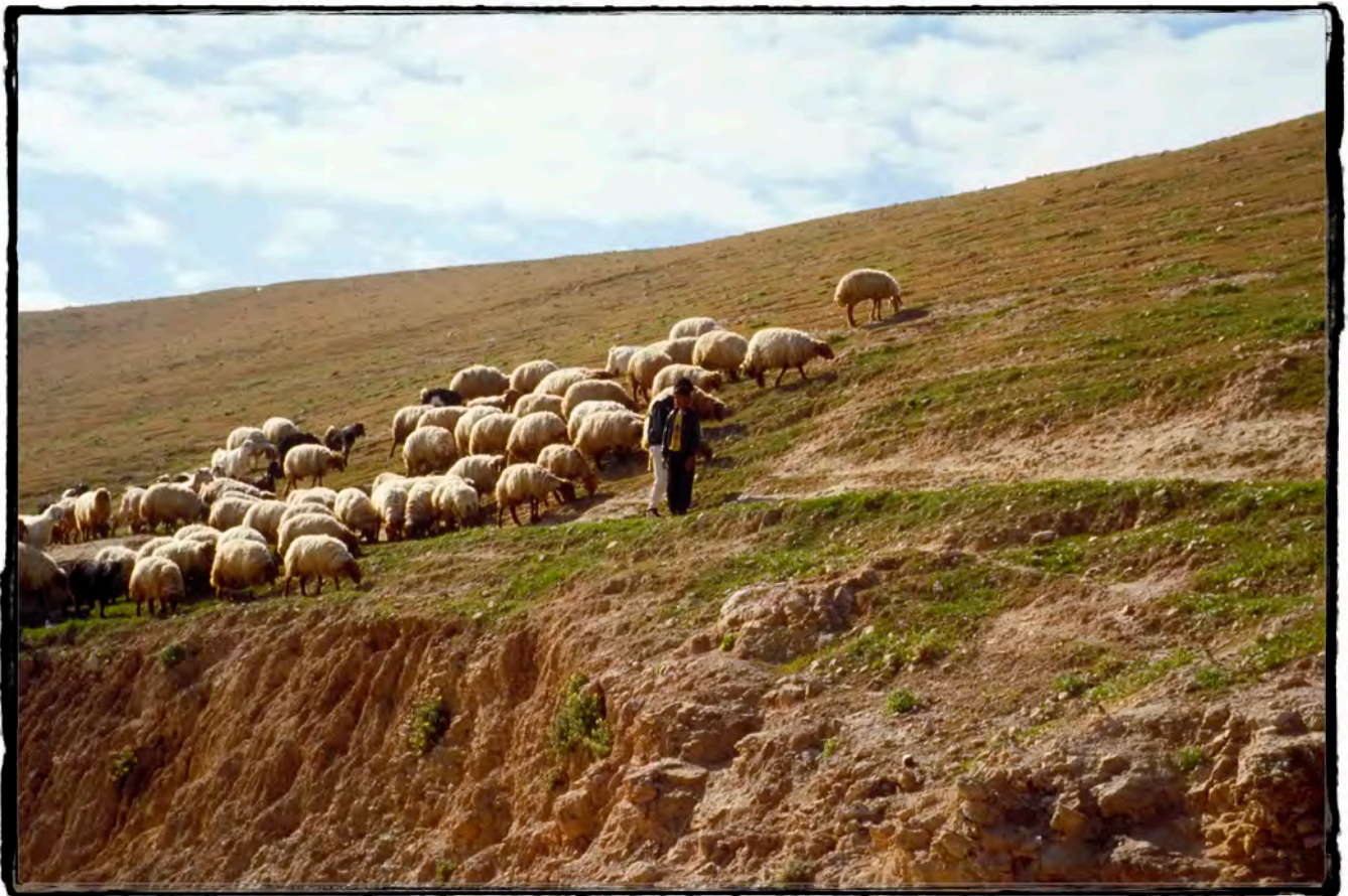
Shepherds in the Wilderness of Judea

“Therefore all the elders of Israel came to the king at Hebron, and King David made a covenant with them at Hebron before the Lord. And they anointed David king over Israel. David was thirty years old when he began to reign, and he reigned forty years.” (2 Samuel 5:3–4)