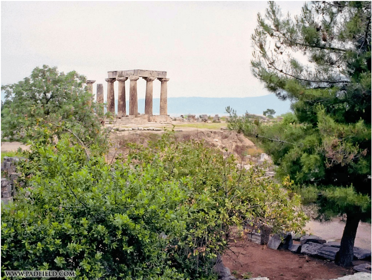
WWW.PADFIELD.COM The Temple of Apollo in Corinth

© David Padfield, 2010. Used by Permission.