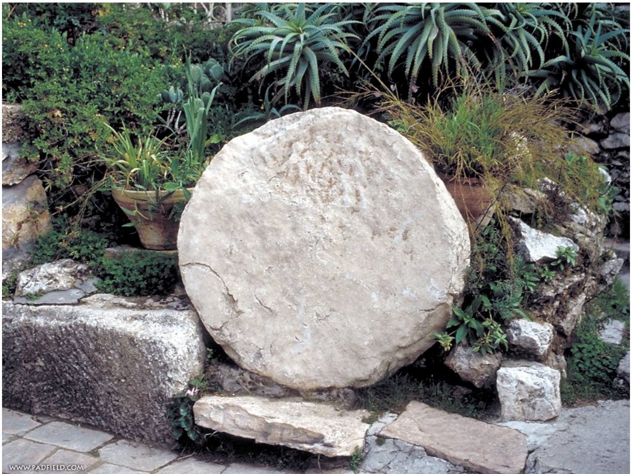
Garden Tomb in Jerusalem at Gordon's Calvary