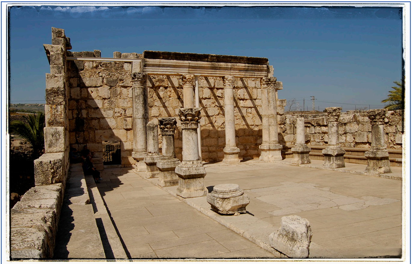
The Synagogue at Capernaum

“And truly Jesus did many other signs in the presence of His disciples, which are not written in this book; but these are written that you may believe that Jesus is the Christ, the Son of God, and that believing you may have life in His name.” (John 20:30–31)