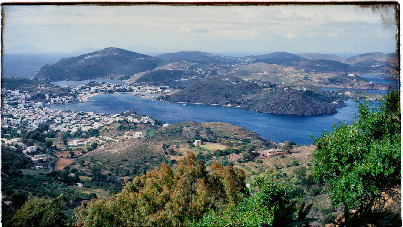
The town of Skala on the Isle of Patmos

“That which was from the beginning, which we have heard, which we have seen with our eyes, which we have looked upon, and our hands have handled, concerning the Word of life—the life was manifested, and we have seen, and bear witness, and declare to you that eternal life which was with the Father and was manifested to us—that which we have seen and heard we declare to you, that you also may have fellowship with us; and truly our fellowship is with the Father and with His Son Jesus Christ” (1 John 1:1–3)