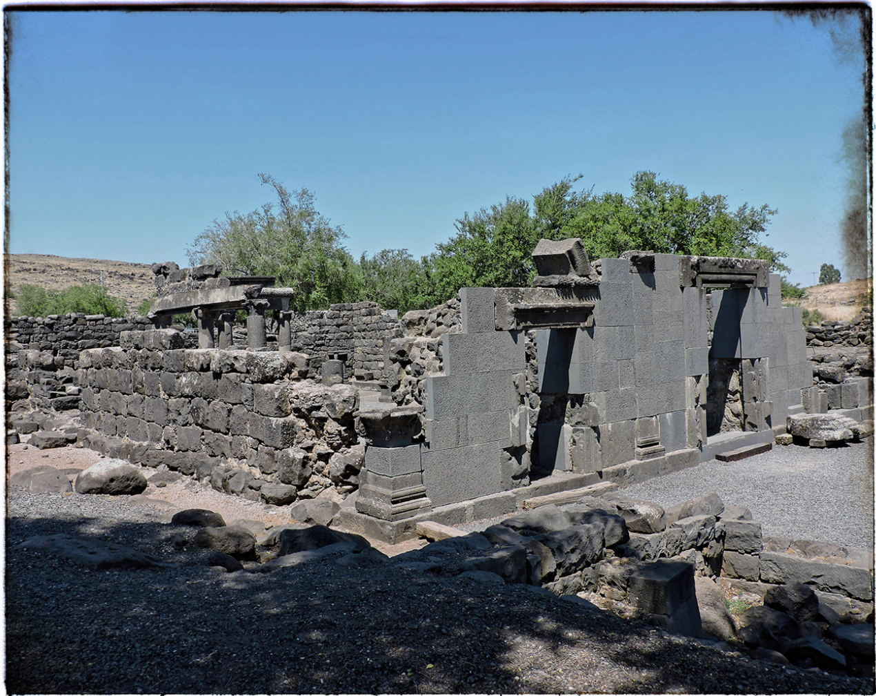
The Synagogue at Chorazin

“Woe to you, Chorazin! Woe to you, Bethsaida! For if the mighty works which were done in you had been done in Tyre and Sidon, they would have repented long ago in sackcloth and ashes.” (Matthew 11:21)