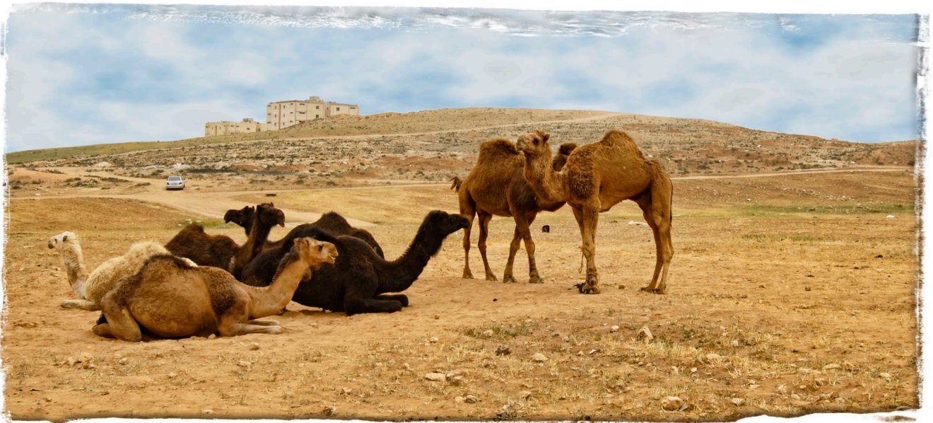
Camels at the ruins of Ramoth Gildead

“Now it happened, when the king heard the words of the Book of the Law, that he tore his clothes. Then the king commanded Hilkiah the priest, Ahikam the son of Shaphan, Achbor the son of Michaiah, Shaphan the scribe, and Asaiah a servant of the king, saying, ‘Go, inquire of the Lord for me, for the people and for all Judah, concerning the words of this book that has been found; for great is the wrath of the Lord that is aroused against us, because our fathers have not obeyed the words of this book, to do according to all that is written concerning us.’” (2 Kings 22:11-13)