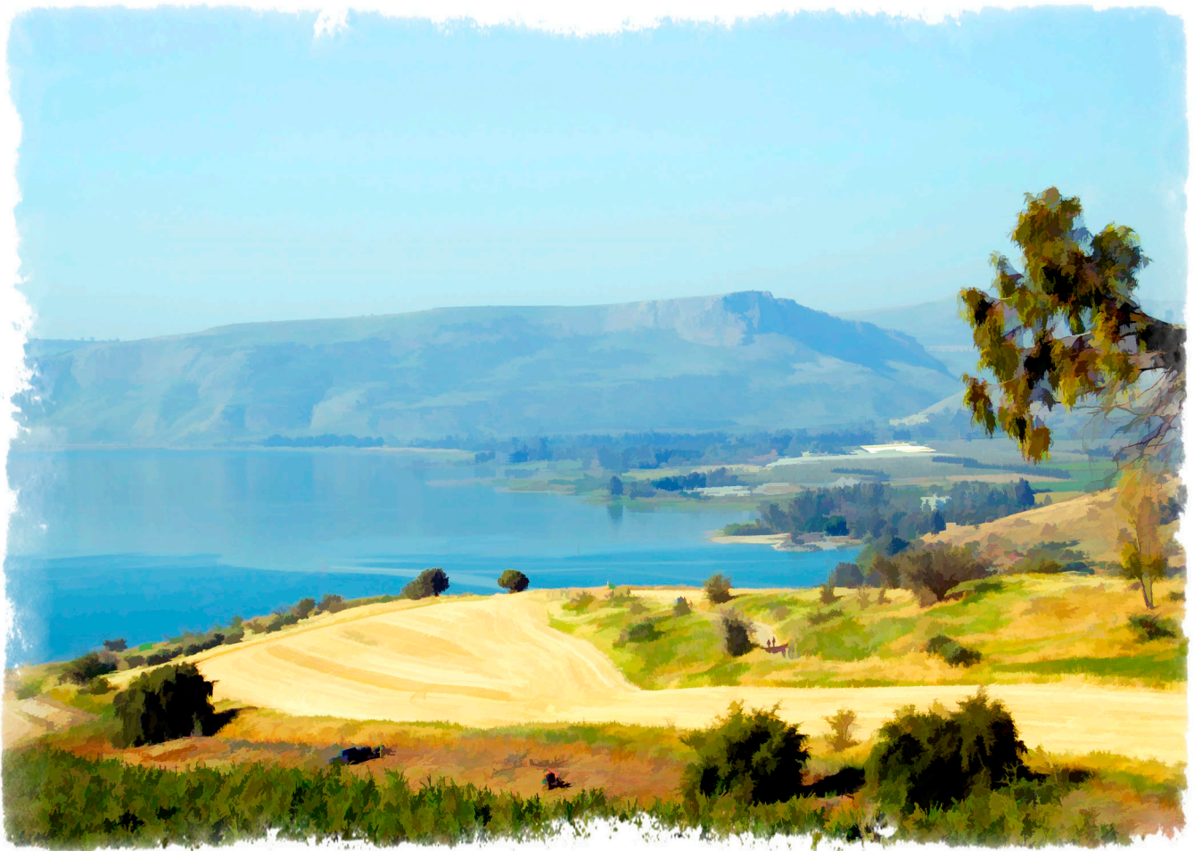
Northern shore of the Sea of Galilee

“When Jesus saw the crowds, He went up on the mountain; and after He sat down, His disciples came to Him. He opened His mouth and began to teach them...” (Matthew 5:1-2)