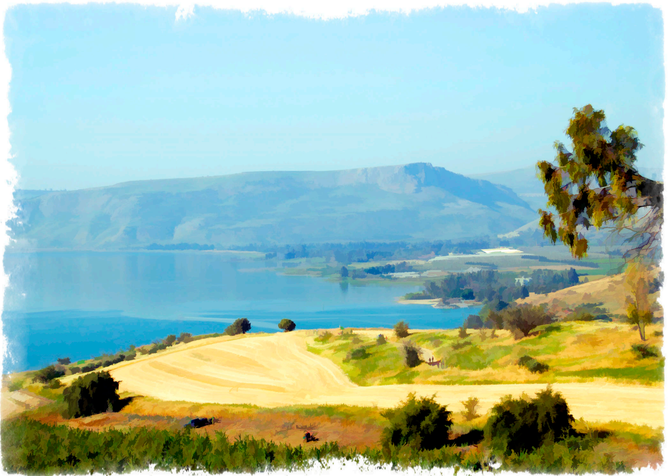
Northern shore of the Sea of Galilee

“When Jesus saw the crowds, He went up on the mountain; and after He sat down, His disciples came to Him. He opened His mouth and began to teach them...” (Matthew 5:1–2)